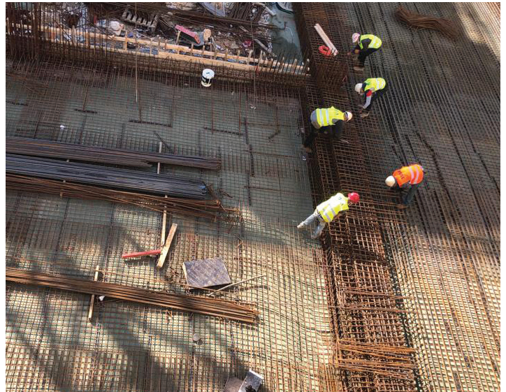
Completion of concrete floor for the Facility Maintenance Department. Underground level -3