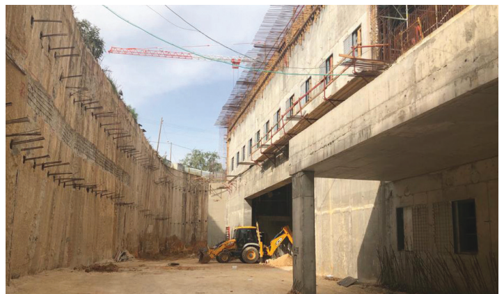
Trucks entrance to logistic floor. Underground level -3