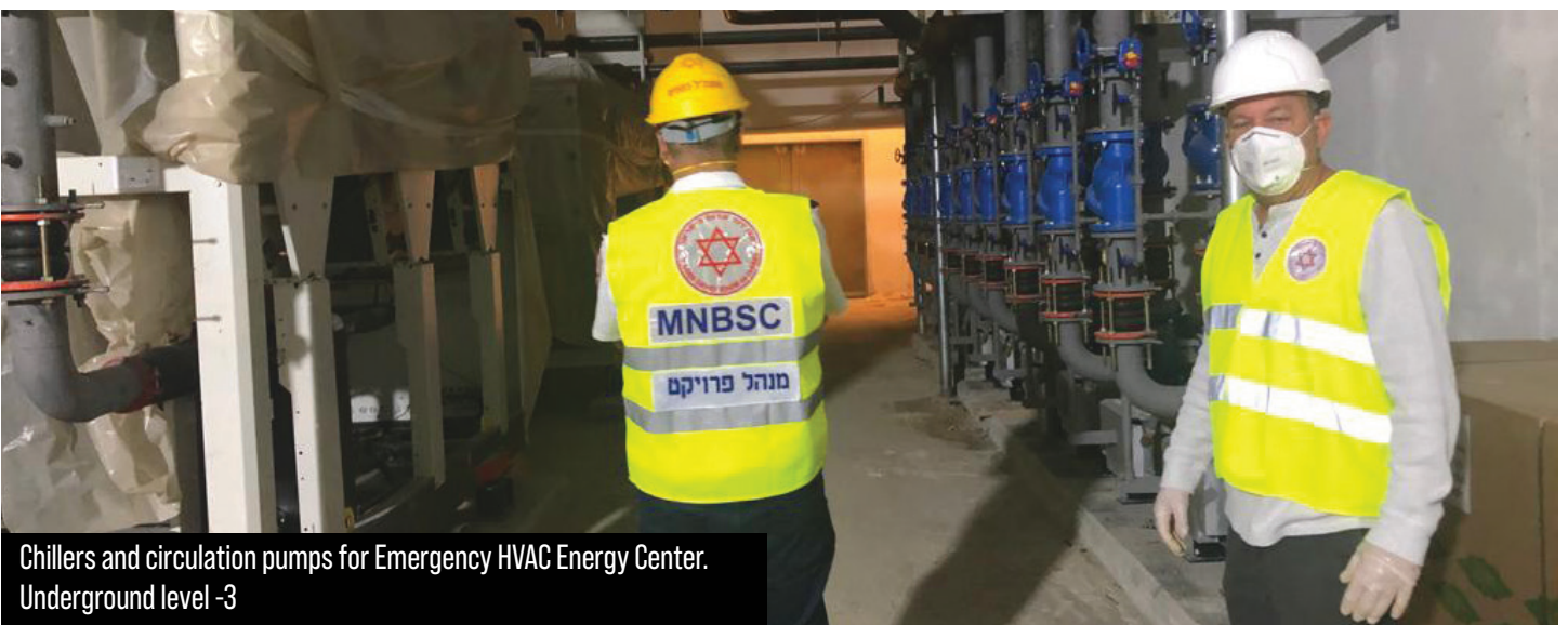
Chillers and circulation pumps for Emergency HVAC Energy Center. Underground level -3