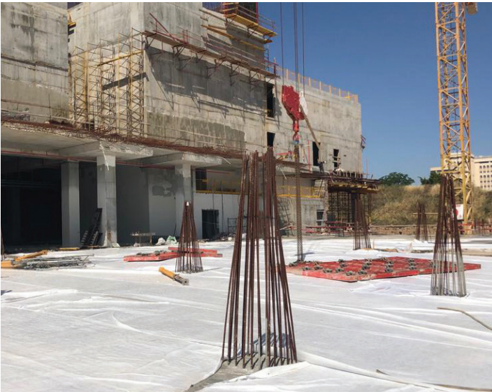
Completion of concrete floor for the Ambulance Center. Underground level -1