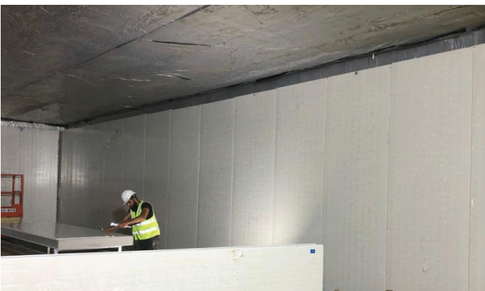
Constructing the storage cold rooms. for Plasma Fractionation Department. Underground level -3