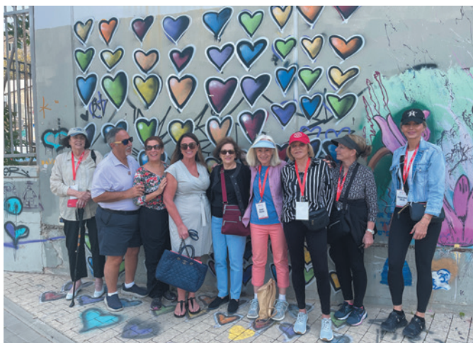
A graffiti tour in Tel Aviv.