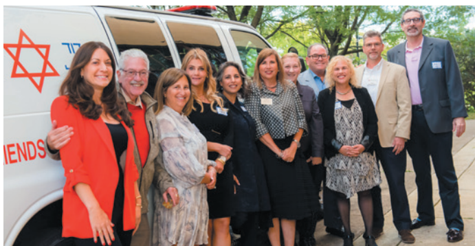
AFMDA Cleveland Advisory Council

In June, a special conversation via Zoom was held for Chicagoland rabbis about MDA's work in Ukraine. The panel included an MDA doctor and three paramedics who had recently returned from providing humanitarian and medical assistance in Ukraine and Moldova.