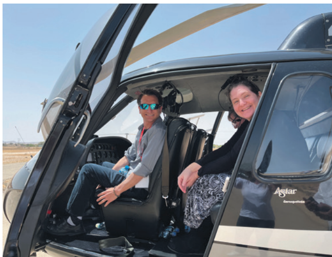
Taking a helicopter tour from Mitzpeh Ramon to Jerusalem.